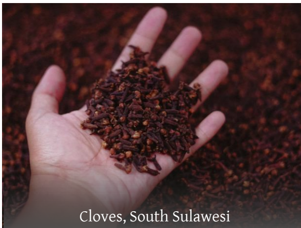
Cloves, South Sulawesi