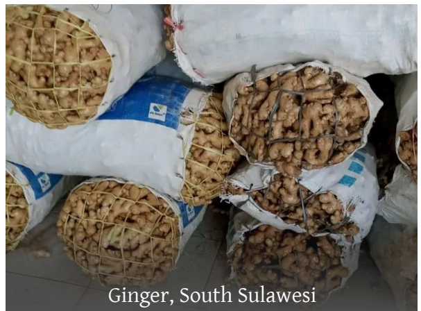
Ginger, South Sulawesi