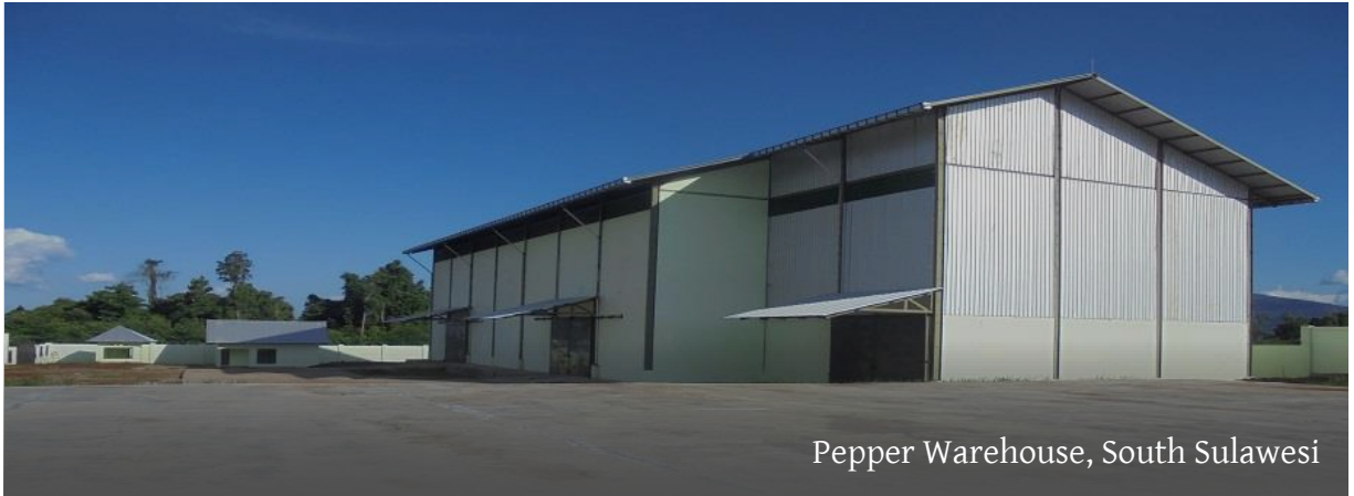
Pepper Warehouse, South Sulawesi