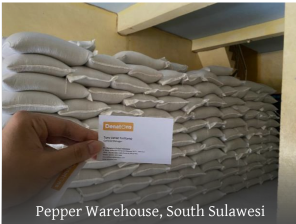
Pepper Warehouse, South Sulawesi