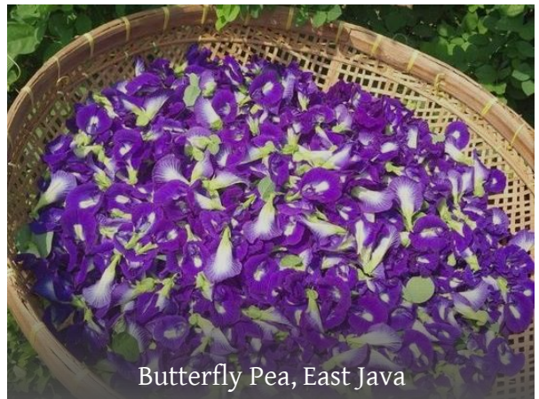
Butterfly Pea, East Java