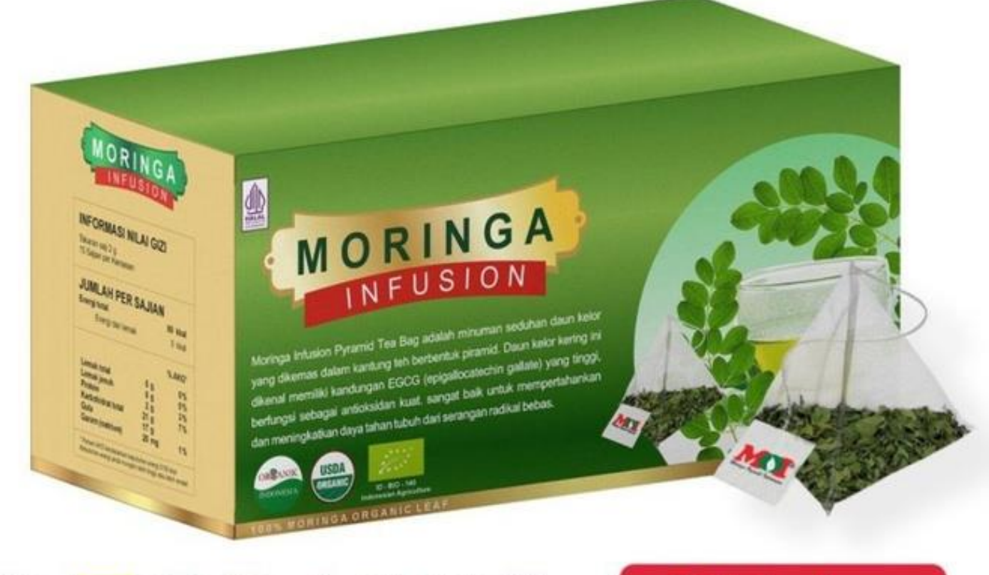
Helps lower cholesterol